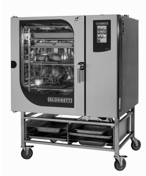
Shown on optional stand with casters