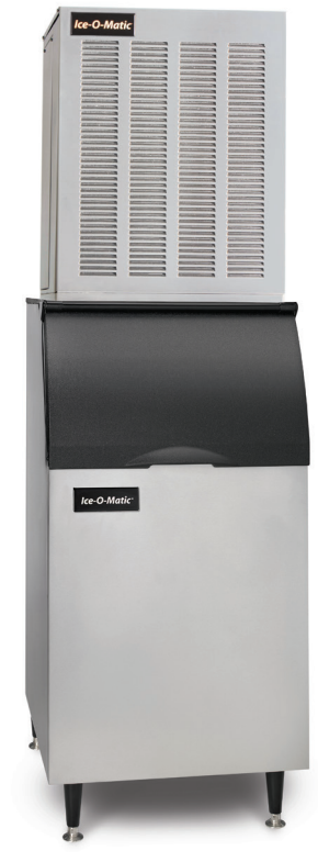
MFI0500 ON B42