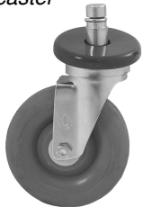
vibration dampening caster