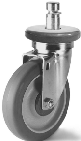
(nickel-plated) caster with polyurethane tread