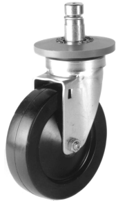
swivel caster with resilient tread

Eagle Stem Caster, model _____. For use with 1"-diameter posts. Resilient or polyurethane tread. Casters with zinc, stainless steel, and polymer boot available. For electronic handling, conductive casters and vibration dampening casters available. Donut bumper included with all stem casters. Swivel casters have a temperature rating of -15°F (-26°C). Note: These stem casters cannot be used with Master Trak® Shelving.