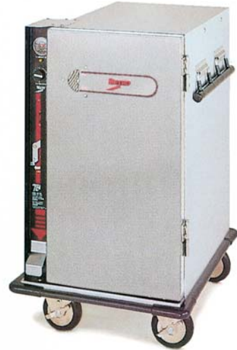
TC90S shown with bumper