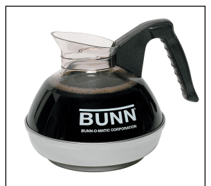
EASY POUR, (BLK) 12/CS