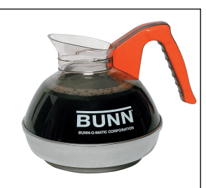
EASY POUR, (ORN) 2/CS