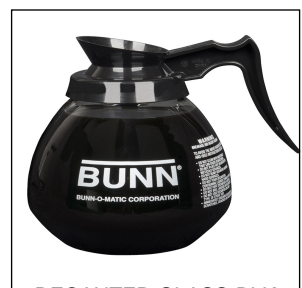
DECANTER,GLASS-BLK 12C 24/CS