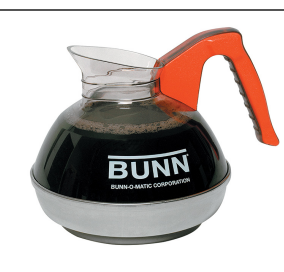
EASY POUR,(ORN) 12/ CS