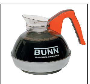
EASY POUR,(ORN) 24/ CS