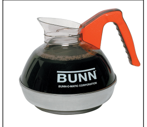
EASY POUR,(ORN) 6/CS