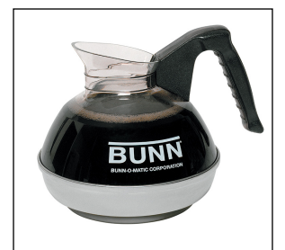
EASY POUR, (BLK) 6/CS