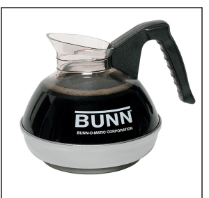
EASY POUR,(BLK) 1/CS