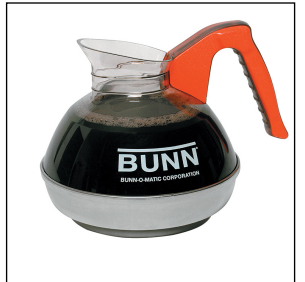
EASY POUR,(ORN) 3/CS