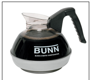
EASY POUR, (BLK) 2/CS