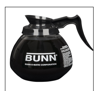
DECANTER,GLASS-BLK 12CUP 1PK