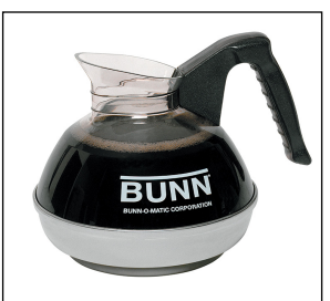
EASY POUR, (BLK) 3/CS