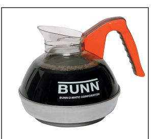
EASY POUR,(ORN) 1/CS