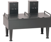
2SH STAND, 120V BLK