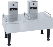
2SH STAND, CE 220-240V 50-60HZ EURO