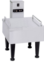
1SH STAND, CE 220-240V W/UK PLUG