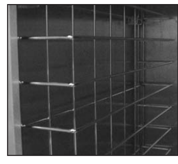
Standard fixed universal wire slides

PAN SLIDES... Universal wire slides at fixed spacing of 3". Assemblies removable. Hold 18"x26" sheet pans, 12"x20" steam table pans, 2/1 or 1/2 G/N pans. Adjustable universal stainless steel pans slides or fixed angle slides are optional.