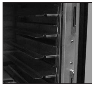
Optional stainess steel adjustable universal slides