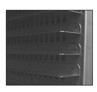
Optional fixed angle slides