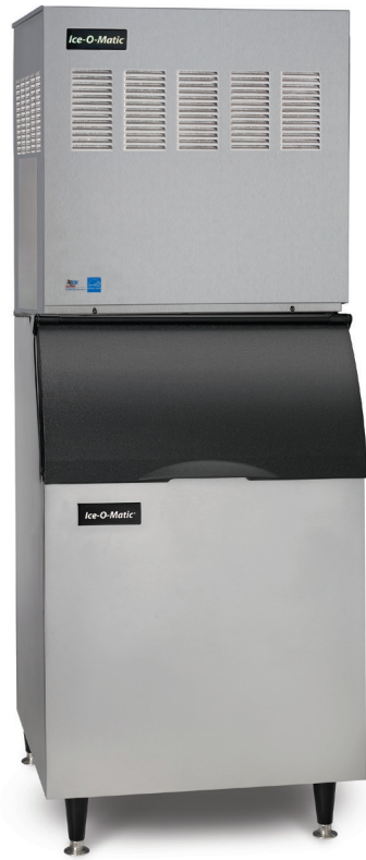
ICE1506HT ON A B55