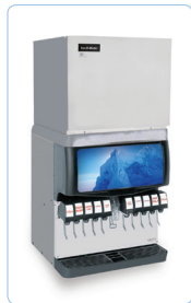
ICE1506R ON A DISPENSER