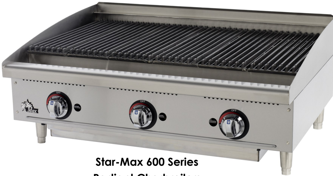
Star-Max 600 Series Radiant Charbroilers

STAR-MAX Radiant Gas Charbroilers are designed and built here in the U.S.A. to deliver exceptional performance, consistent and reliable results year after year. Available in 15", 24", 36" and 48" widths.