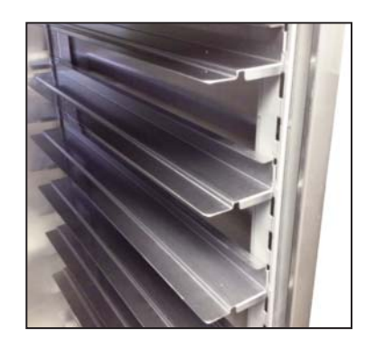
TRAY RACKS... with adjustable pin positions to accommodate a variety of tray sizes. Tray spacing is adjustable on 1.75" centers. Standard spacing is 5.25".

Since 1947, Foodservice Equipment That Delivers!