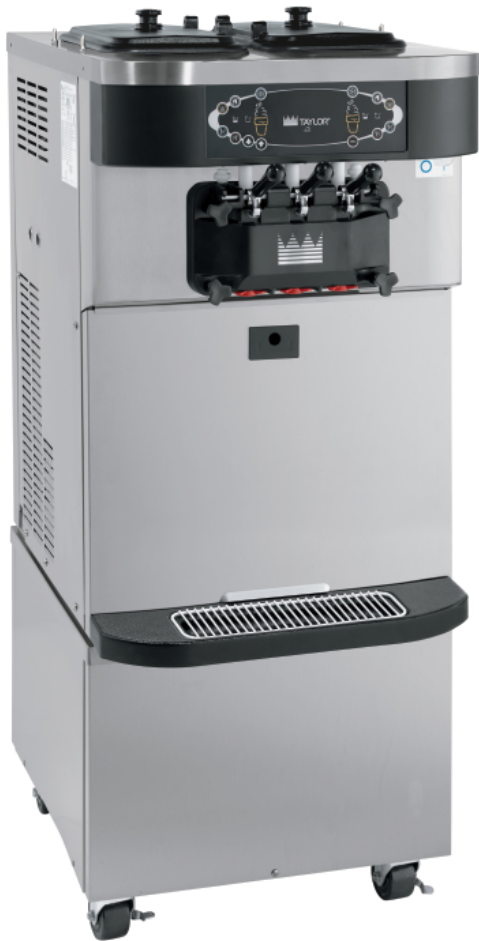
Shown with optional ADA cart