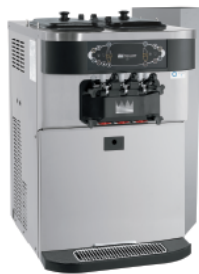
Shown with optional top air discharge chute