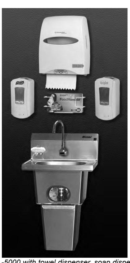
#HFL-5000 with towel dispenser, soap dispenser, hand sanitizing dispenser and glove rack