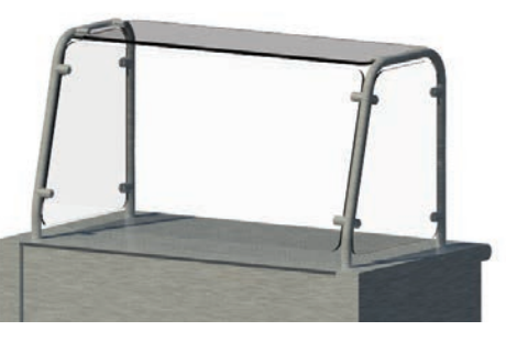
CAFETERIA STYLE 19" Standard Front Glass Height

*3/8" Thick Heat-Tempered Glass Required For Front