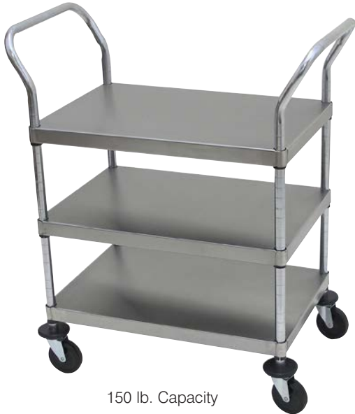
150 lb. Capacity