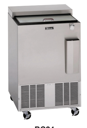
BC24 (shown with optional opener, receiver and casters)