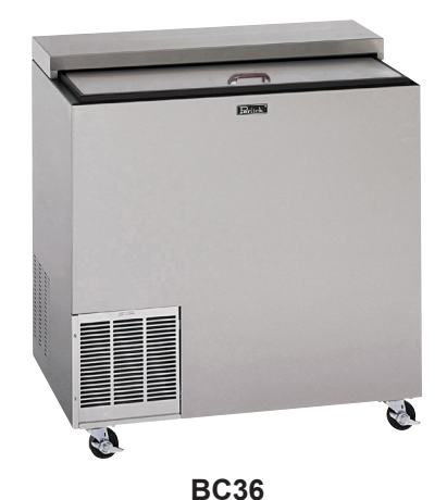
(shown with optional casters)