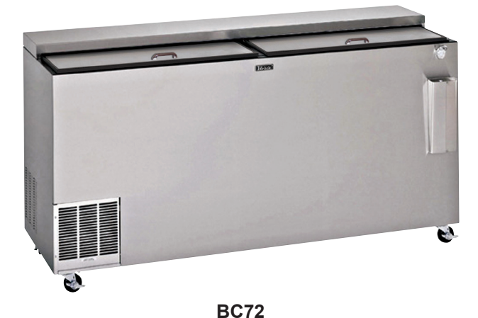
(shown with optional opener, receiver and casters)