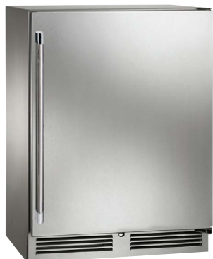
HD24RS Shown with Solid Stainless Steel Door (S)