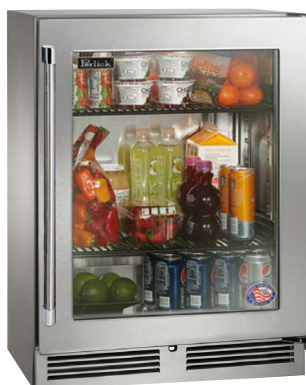
HD24RS Shown with Glass with Stainless Steel Frame Door (S)