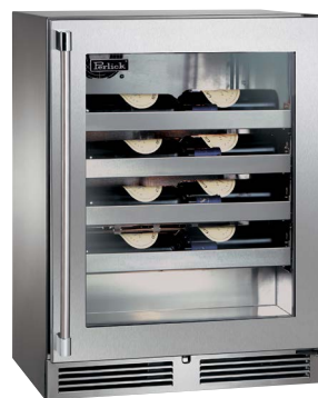
HD24WS Shown with Glass with Stainless Steel Frame Door (S)