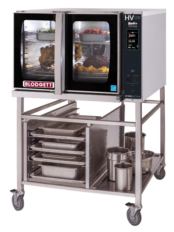
Shown on optional stand with casters

Full-Size Electric Hydrovection Oven with Helix Technology