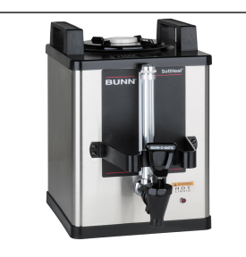
SH-S SERVER 1G 60 MIN ADJ TMR