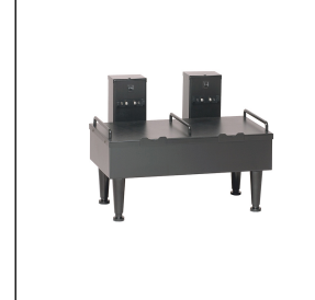
2SH STAND, 120V BLK