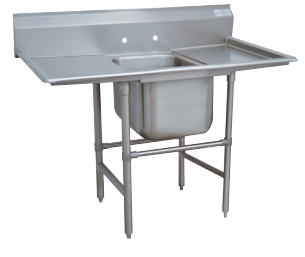
94 SERIES Welded Side & Adjustable Front & Rear Cross-Bracing