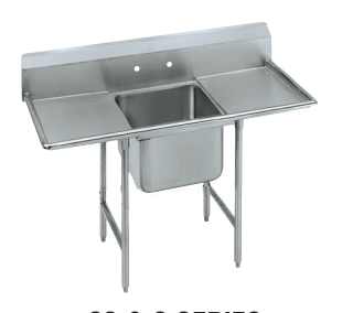
93 & 9 SERIES Welded Side Cross-Bracing