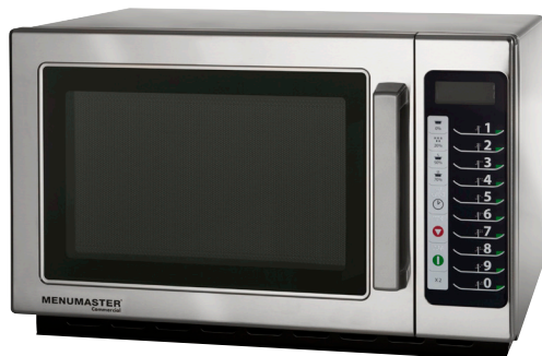
Model MCS10TS shown