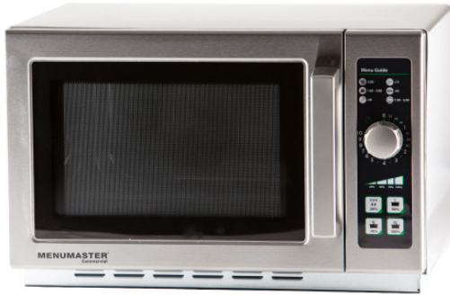
Model MCS10DSE shown