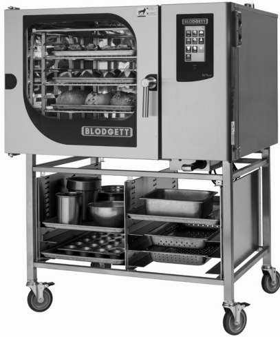
Shown on optional stand with casters