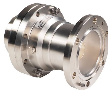
318EIA Connector for HCA300 Cable