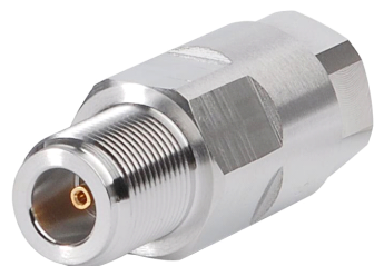
Type N Female for 1/2 in F5J4-50B cable